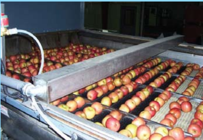
Light Sensor Bar - capturing data to assure the best results.