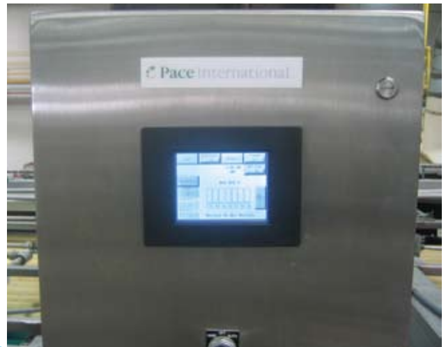
Operator Interface - display panel for quick and easy monitoring.