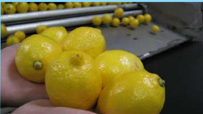
Even Shine, Effective Decay Control

The PaceSetter system controls the application to match both the rate of fruit entering the waxer as well as matching variations in zones across the width of the wax bed. The result is the elimination of foaming and application of a consistent gloss on each piece of fruit. Fungicides are also applied at the exact rate you need for a uniform distribution of coating / fungicide mixture on fruit for consistent shine and decay control.