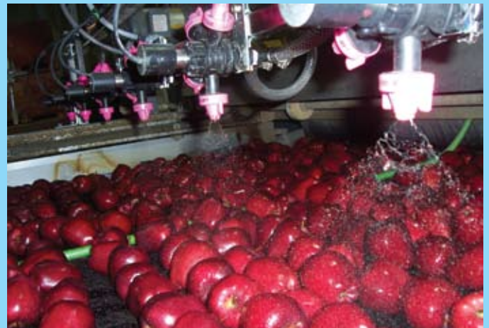
Spray Nozzles - application on red delicious.