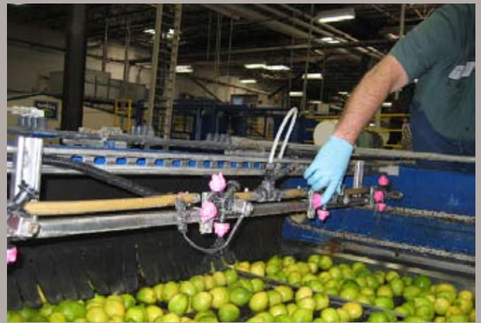
Pace Technical Services - fine tuning PaceSetter spray nozzles.